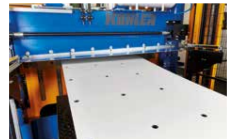
— The cut-to-length shear cuts the strip to the precise length of the later edge profile.