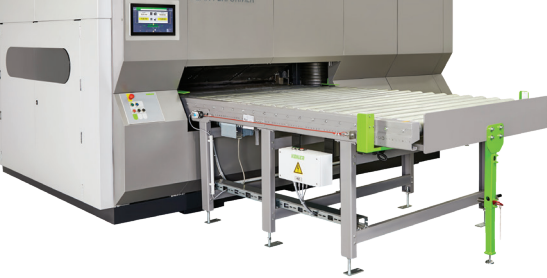
KOHLER Peak Performer, a hydraulic-free part levelling machine