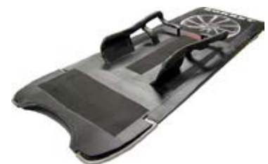
The skeleton sleds are manufactured from stainless and high-strength steels with a thickness of between three and eight millimeters. They consist of cowlings, a frame, and two runners.