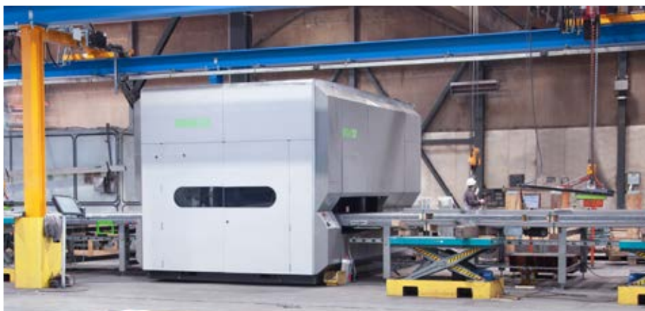
Around 400 tons of material are leveled at DEUMU every month on average.

With the Peak Performer range, which has enjoyed many years of success, KOHLER offers high-performance and energy-efficient part leveling machines for numerous applications. These machines are used in particular for leveling parts, blanks, and whole sheet metal plates.