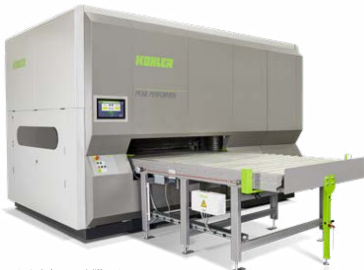
KOHLER’s leveling center includes several different variants of the state-of-the-art Peak Performer part leveling machine.

The skeleton project manager is fully satisfied with his new technology partner and the results of the contract leveling. “The struts and base panels of our sleds exhibit a very high degree of precision after leveling, even with long lengths and different material grades,” he sums up. “We can use this to simplify the further assembly process because we are required to perform significantly less manual rework.” Leveling also almost entirely eliminates tension in the material. “Our athletes therefore benefit from very clear advantages in competition because they can use the best possible equipment,” Zerbe is delighted to report, adding: “We are already carrying out leveling tests with KOHLER in the luge area too, so there will be additional collaboration here in the near future.”